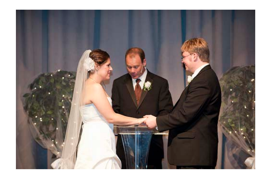
At weddings we listen to the person marrying the bride and groom.