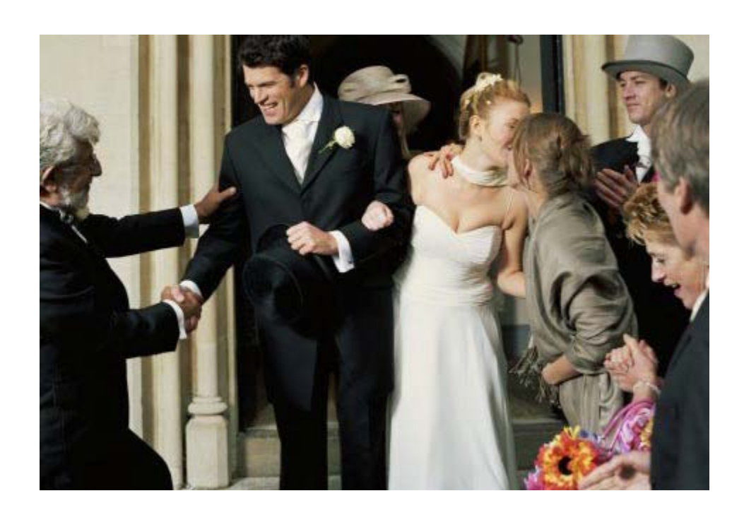
Or "you look very handsome today" to the Groom